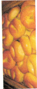
Left Bohemia Bagel Right Hospůdka Na Čertovce